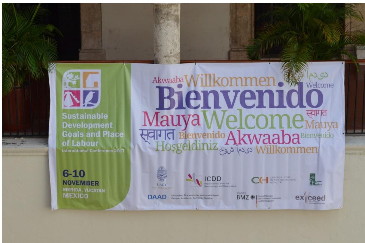
Welcoming banner at Universidad Autónoma de Yucatan main campus, Merida, Yucatan, 6-10 November 2017)

Occupational health and safety is a core element of the ILO's Decent Work Agenda. Despite hazardous disposition of agricultural work, unfortunately, the occupational health and safety (OHS) issues in agricultural sector are frequently ignored. The International Center for