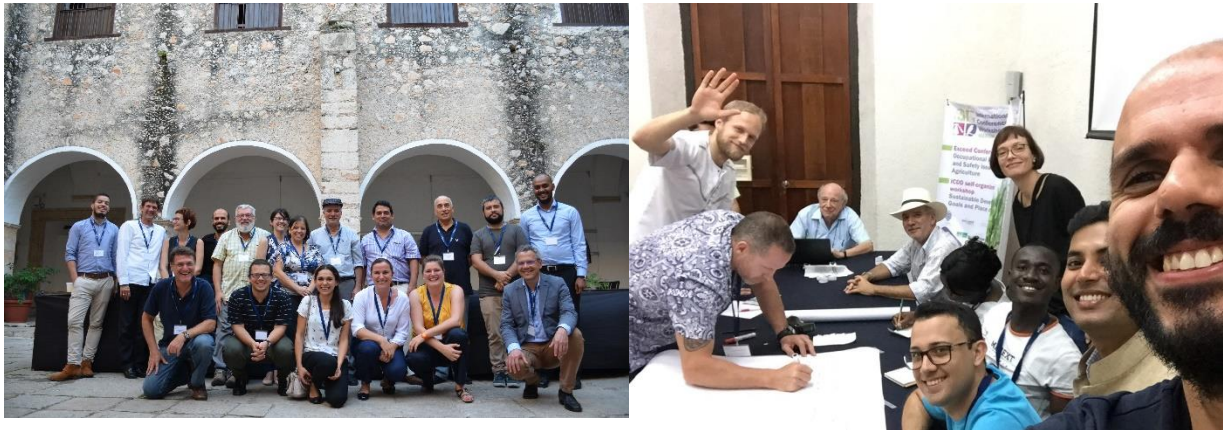
Left: Group picture. Right: Group work of newly assembled research cluster “Third party-certification, OHS, policy implications, and value chain” at the Faculty of Architecture (Universidad Autónoma de Yucatan, Merida, 6-10 November 2017)

clusters, worked together and came up with concrete proposals.