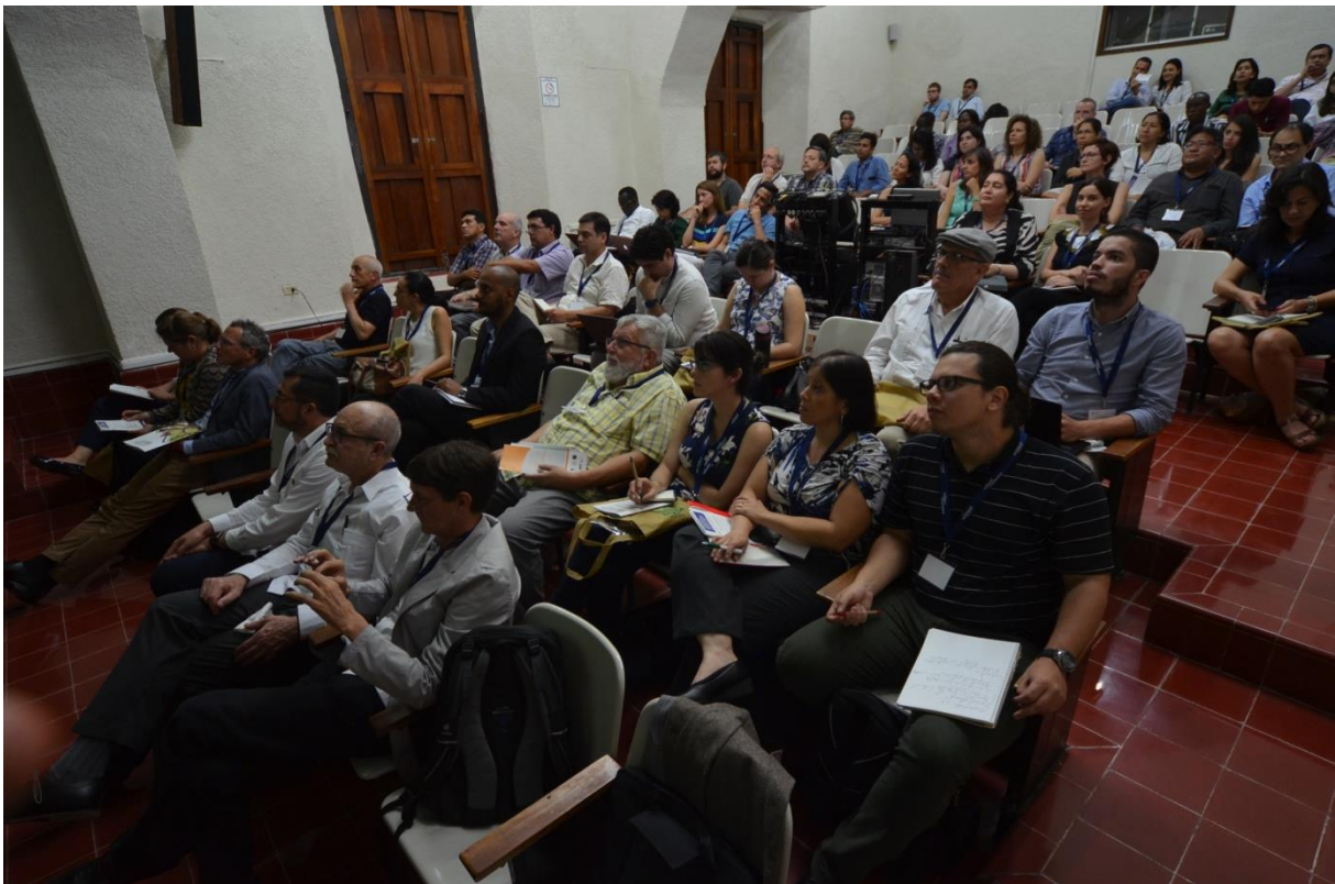
Conference participants at the Faculty of Architecture (Universidad Autónoma de Yucatan, Merida, Yucatan, 6-10 November 2017)

Various agricultural product provisions have been extensively studied throughout the program, unveiling, various interwoven tasks – ranging from the way of using pesticide, harvesting, marketing, certification–carried out by different actors such as agricultural workers, supermarkets, and certification firms. The case studies covered arrays of crops varying from melon to palm oil, and regions from Brazil to India. What made this conference more fruitful is that participants of the conference focused on different scales of OHS: Some focused on individual level, some on workplace, while some contributors confined their attention to the macro level questions such as labor standards and OHS measures. Thus, the presentations were complementary to each other.